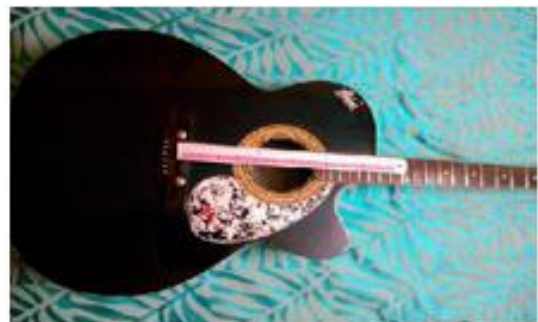
Figure 1. Structure of the box shaped Acoustic Guitar Body

Response Approach. Part V is the summary of our synthesis using cepstral domain adaptive window technique.